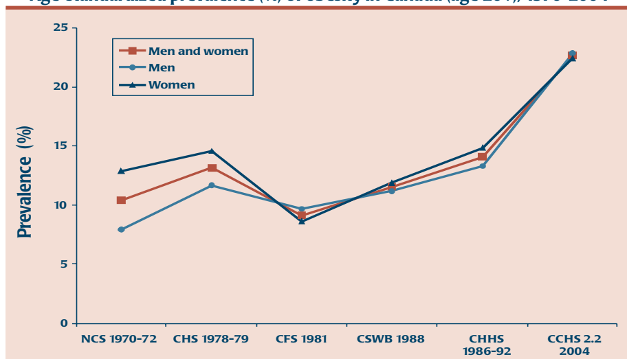
FIGURE 1 Age-standardized prevalence (%) of obesity in Canada (age 20+), 1970-2004

Source: 6 surveys with measured height and weight (age 20+), Statistics Canada.